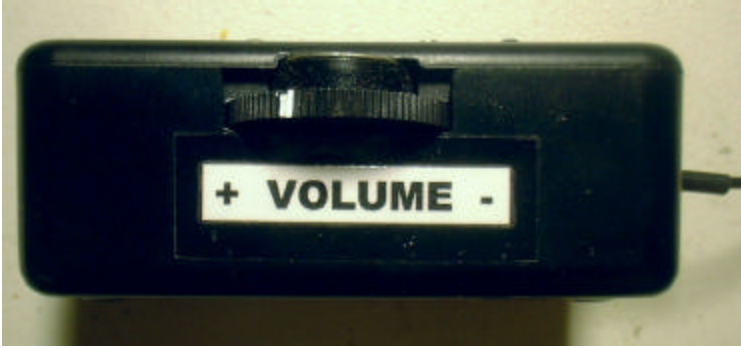
Figure 2. Top view

The circuit was built into a small project box (Radio Shack P/N 270-1801). The volume control came from Mouser Electronics. I don't know the part number.