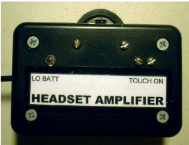
Figure 3. Front view

The circuit was built into a small project box (Radio Shack P/N 270-1801). The volume control came from Mouser Electronics. I don't know the part number.