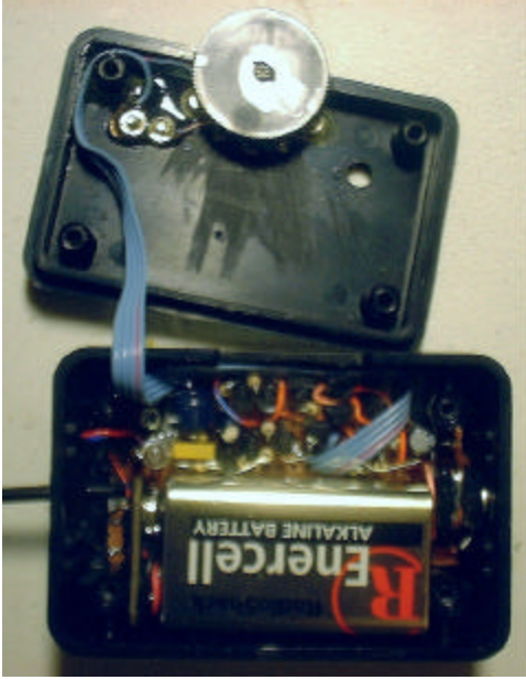
Figure 4. Inside view