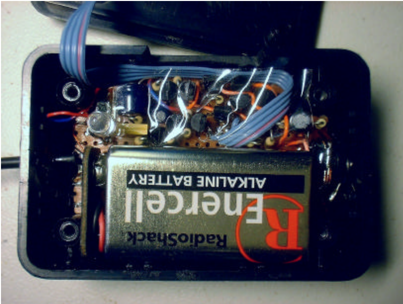
Figure 5. Inside close-up view.

I had to cut the top off an old 9-volt battery to make the battery connector. As you can see, there is no room for an off-the-shelf part. I drilled a small hole in the middle of the connector to put the wires through as a strain relief.